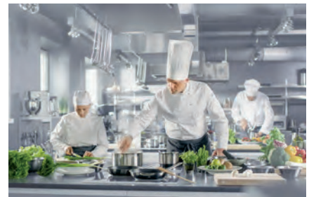
Commercial Water Heating Solutions