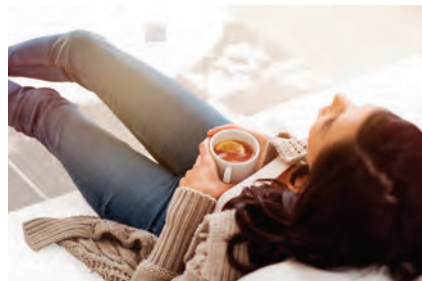
Home Heating Solutions